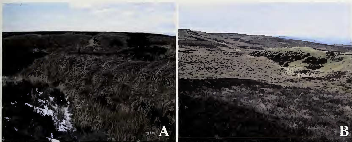
Fig. 3. Adder Vipera berus hibernacula on an upland moor at study site A. (a) South facing gully slope covered in bracken and some gorse. (b) South facing rock outcrop, with some heather and bracken.

lizards Zootoca vivipara were also detected, but no slow-worms Anguis fragilis .